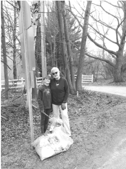
Hannah's mum and daughter helping out with the Women's Institute Roadside Clean-up Campaign

Legislature update: Motions/Bills - Motion 57 - Urging an audit of the Provincial Nominee Program. Members' Statement - "No Choice" Kate McKenna's book on the struggle for reproductive rights on PEI.